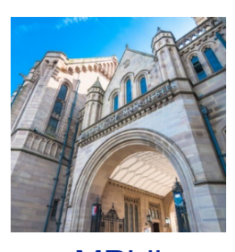
MPhil Manchester, UK