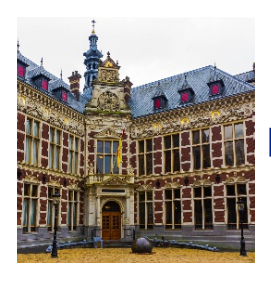
MSc Utrecht, Netherlands